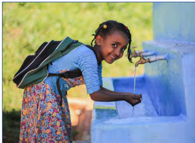
Picture taken from WaterAid website illustrating a project in Ethiopia.

You may remember that I suggested that if we raised £400 that would buy 10 rolls of water distribution pipe and install two tap stands. Those tap stands would make a world of difference for other families.